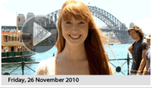
Friday, 26 November 2010